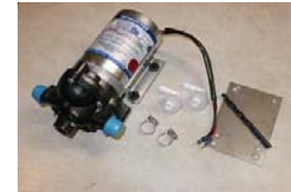
E-100 Replacement Pump Kit