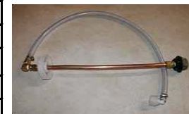
E-100 Intake Line Upgrade Kit