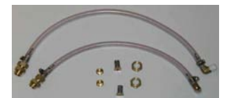
E-100 Spray Nozzle Body Assembly Upgrade Kit