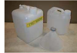
Paint Storage, Mixing and Cleaning Kit