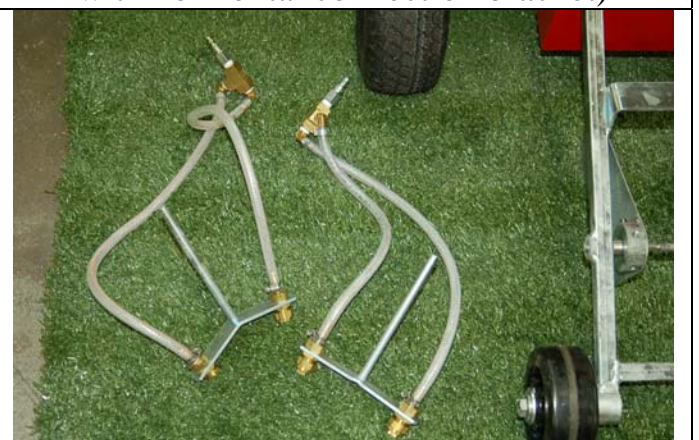
Standard & Modified Nozzle Bracket Assembly