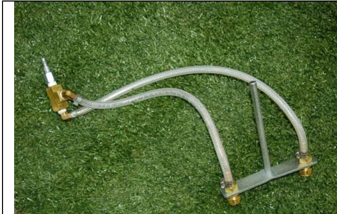
Nozzle Bracket Assembly