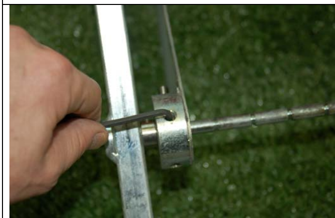
Shield Width Adjustment, Loosen and Tighten Brass Tipped Set Screws