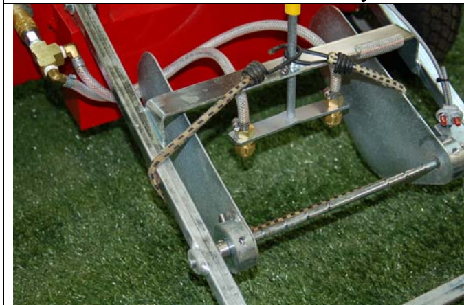
12" Line Width with Shields Up